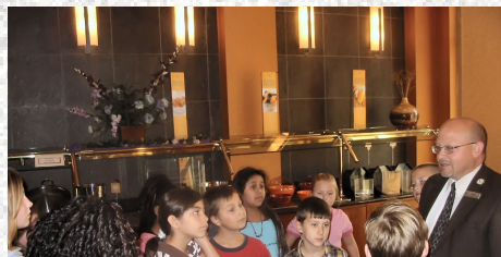
At left student council members visiting the Doubletree Hotel.

The Washington Student Council would like to thank all those who donated canned food items for our food drive. We worked with the Doubletree Hotel and collected over 200 pounds of food!